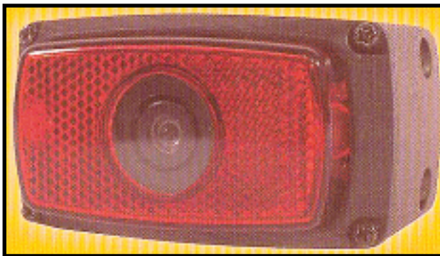
INN-ML/INN-MLC Marker Light Camera