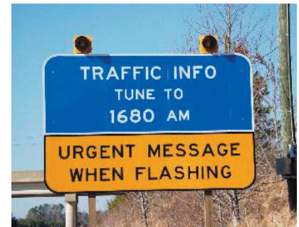
Flashing Beacon Sign

Flashing Beacon Signs alert motorists of important event information. These signs allow motorists to distinguish between an emergency and non-emergency broadcast.